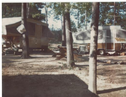
Camping at Indian Falls, NY