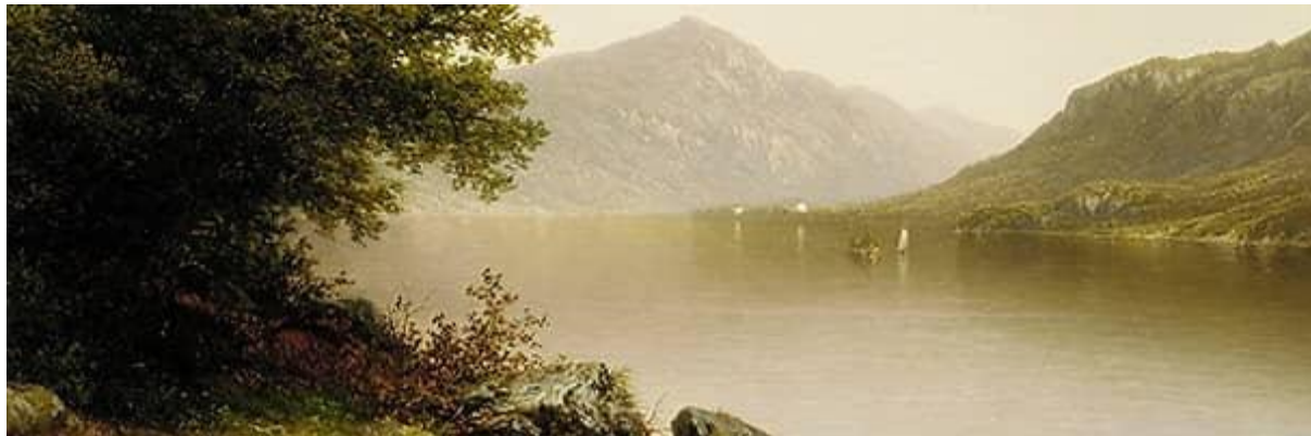
'Lake George' (1857), an oil painting by John William Casilear