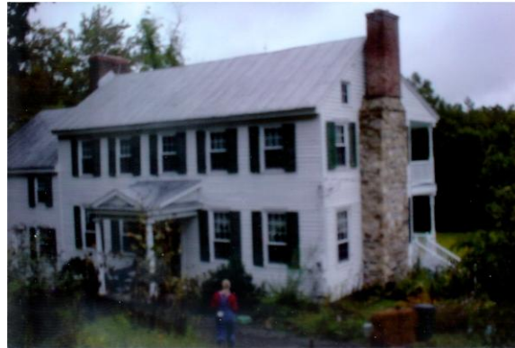
Granddad's home at Hooks Mill as it looked in 2002.