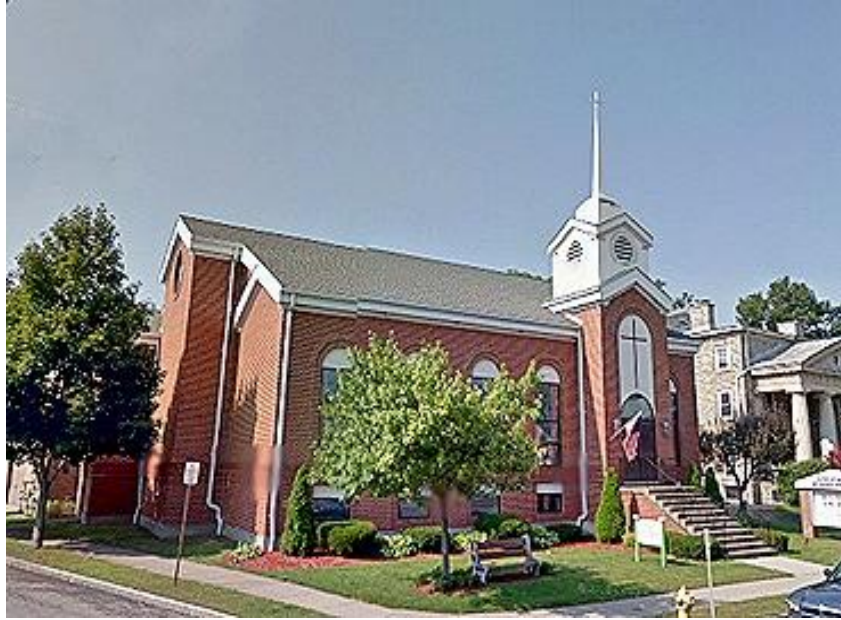
Faith United after rebuilding from 1984 fire