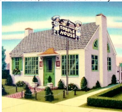
The Toddle House, as it looked similarly in Youngstown.

The Toddle House was a 24-hour forerunner of what became the Waffle House. It specialized in breakfast and most particularly the pecan waffle (which I had – topped with scrambled eggs and maple syrup, every morning when I worked the night shift). We also served a tenderloin steak for $1.15, Toddle House Chili for 35 cents and Toddle House Ice Box Pie for 15 cents.