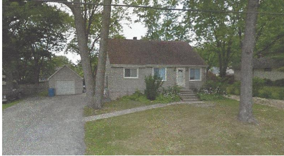
2196 Glenwood Ave. McKinley Heights as it now looks on Google Earth