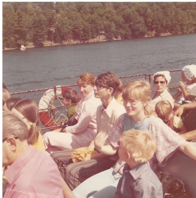
1972 trip to the Thousand Islands area

We also had drainage problems in the basement. This was the first of three houses that we bought that later had drainage problems. The basement had a sump pump that mostly kept water out but several times when the power went off, there was a problem. Once after a holiday trip we came home to about a foot of water in the basement almost up to where our laundry appliances were raised. We spent the next day or two using buckets to throw water out of the basement windows. We also had to replace the pump on our water well during our time there.