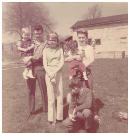
Family at Dad's Farm, summer 1969

On July 20, 1969, the Apollo 9 Astronauts landed on the moon, we were all glued to our TV sets for that, and the splashdown return 4 days later. Apollo 8 astronaut William Anders, later said that although the astronauts went on their mission to explore the moon, what they really discovered was the planet Earth. He added: "I think it's important for people to understand they are just going around on one of the smaller grains of sand on one of the spiral arms of this kind of puny galaxy [...] it [Earth] is insignificant, but it's the only one we've got." On August 15, 1969, the Woodstock Music and Art Fair opened in upstate New York and had almost a half million attendees.