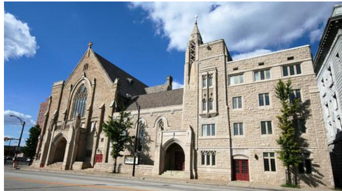
Trinity Methodist Church