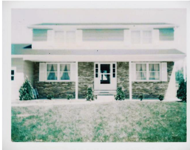
Our first owned home