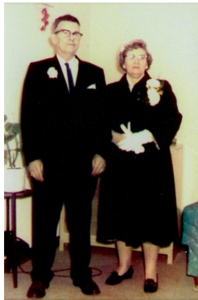
Mom and Dad after 2 nd marriage

In December 1963, my mother and father remarried after almost 25 years of divorce. I know that they loved each other all that time, even though they didn't often express it. Dad bought a house with a few acres in Brownsville, PA; it was the only house they ever owned. They lived out his last years on his pride-and-joy farm. We visited them as often as we could from Pittsburgh and later Buffalo.