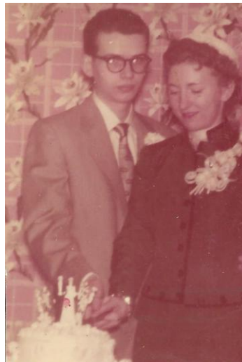
The best day of my life